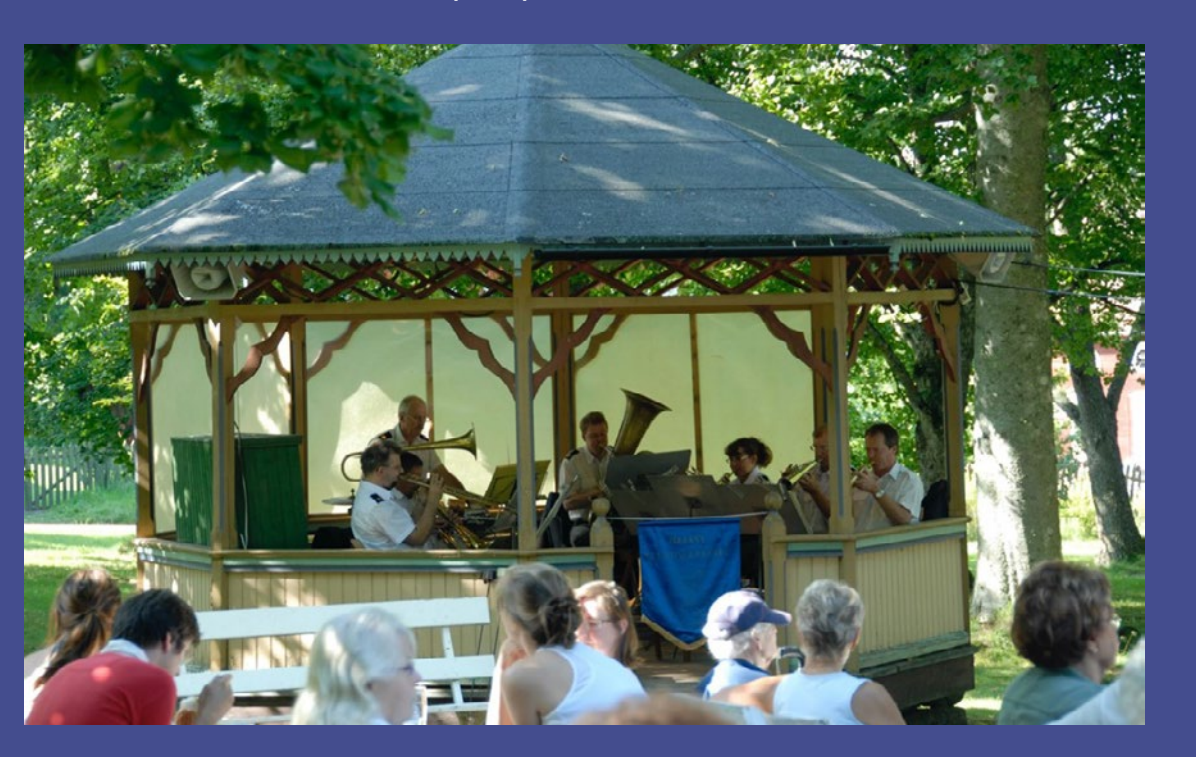
Medevi Brunns Orkester ("MBO") in the park