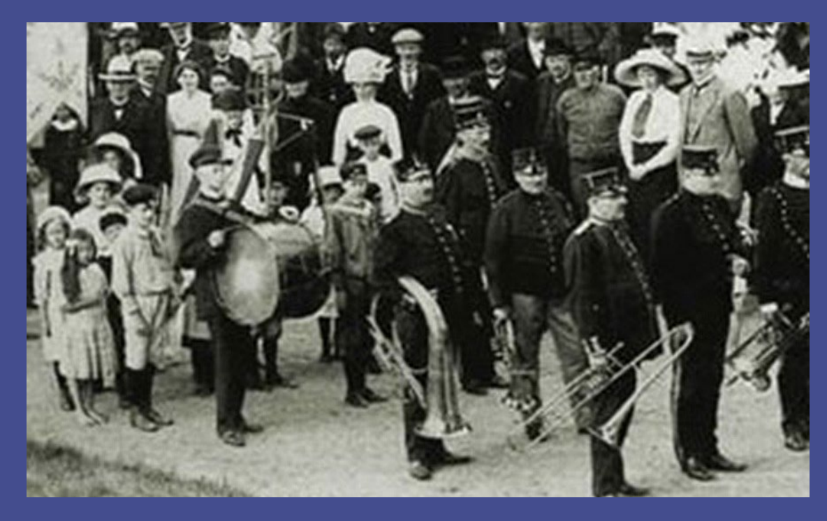
Grötlunken from the early days