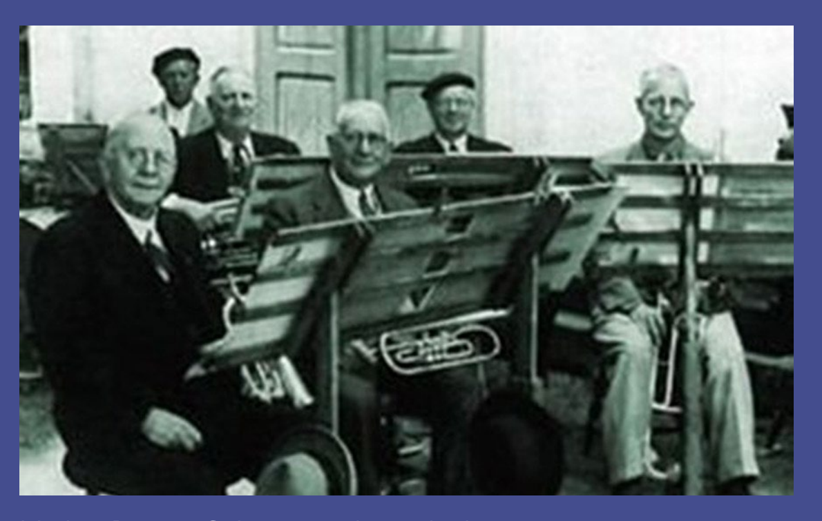
Medevi Brunns Orkester in the early days