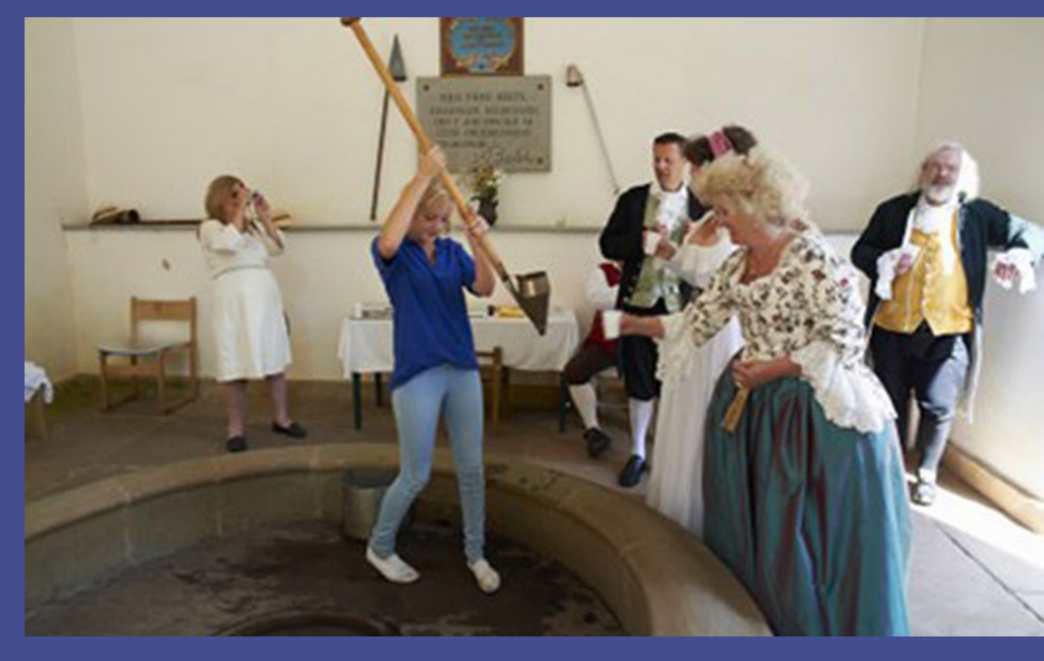
Water served in Högbrunnen