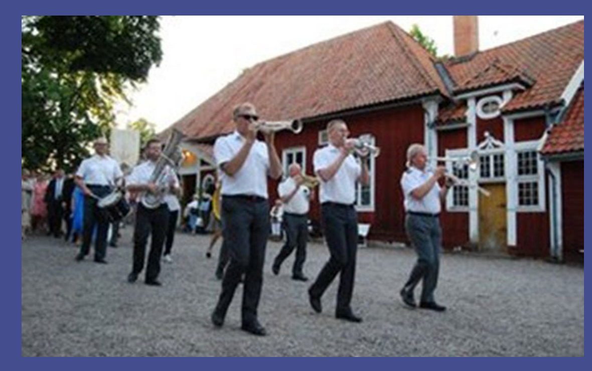
MBO leading Grötlunken